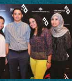
Delegates from Iskandar Malaysia